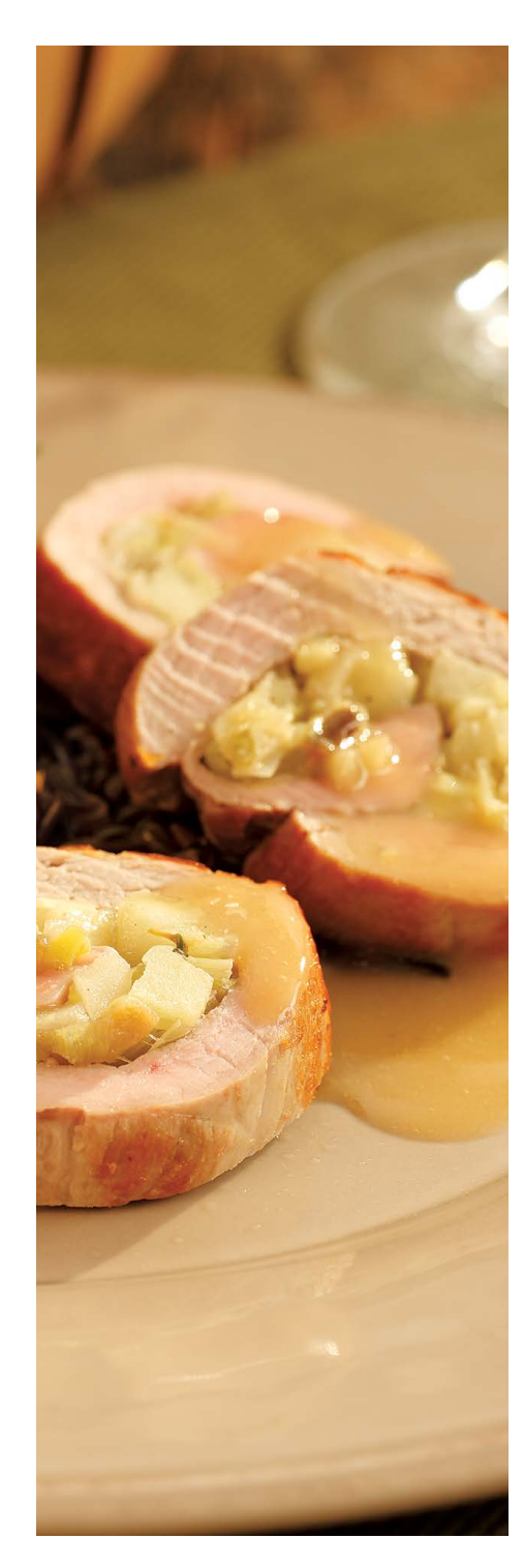
Apple-&-Leek-Stuffed Pork Tenderloin