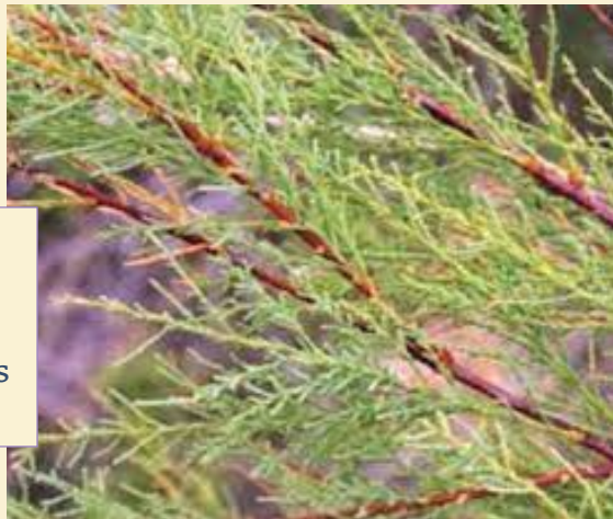
Closer look at the braches

Management: Garlon - Late summer or early fall, DO NOT apply near irrigation ditches