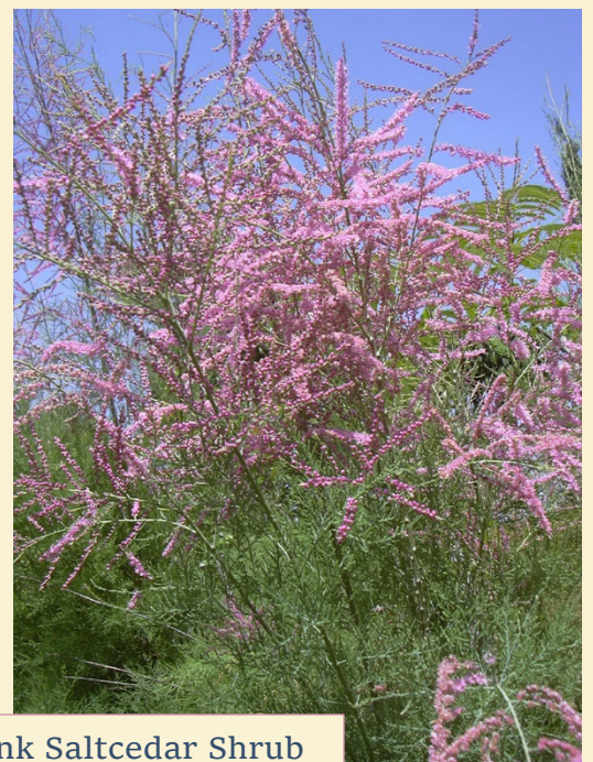
Pink Saltcedar Shrub