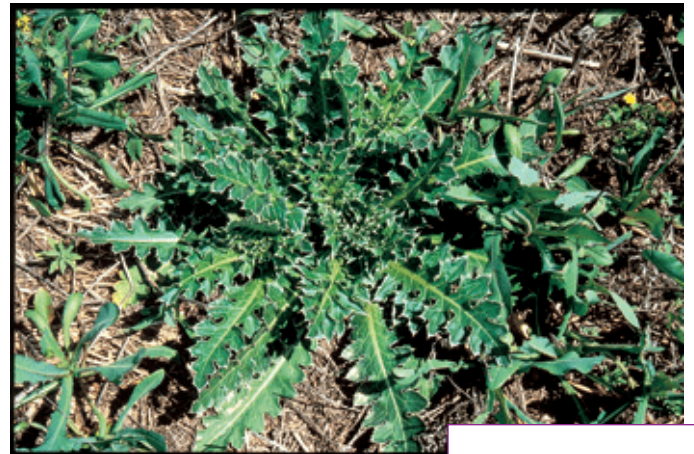
Rosette stage of growth