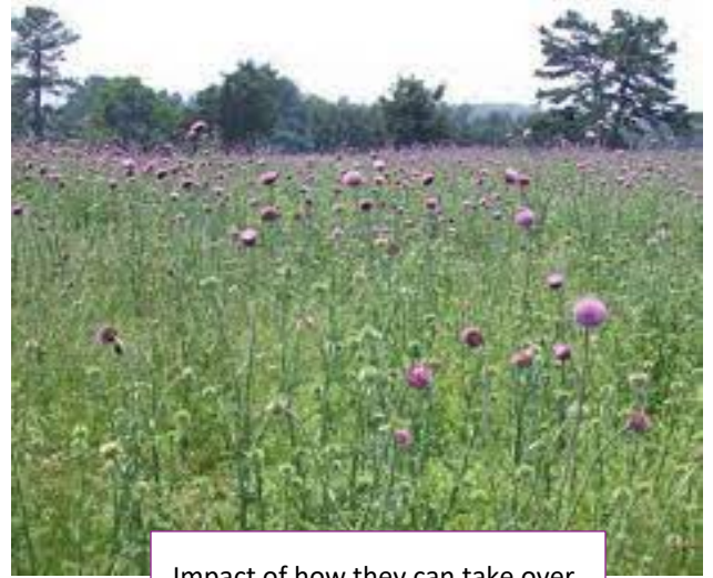
Impact of how they can take over