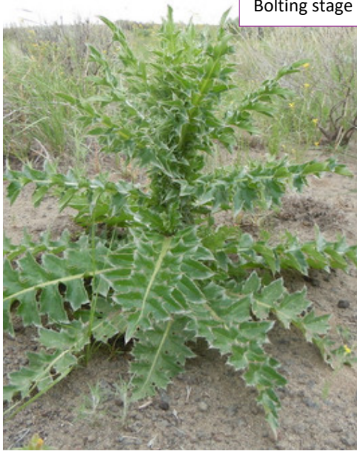
Bolting stage of growth